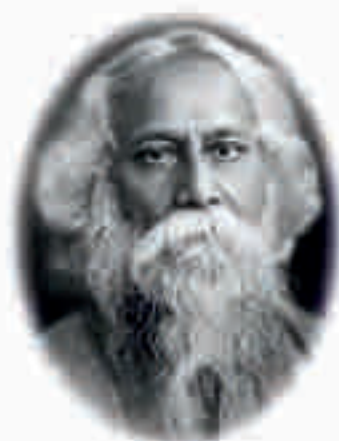
Gurudev Rabindranath Tagore

"We may become powerful by knowledge, but we attain fullness by sympathy. The highest education is that which does not merely give us information but makes our life in harmony with all its existence", Rabindranath Tagore, a polymath, philosopher, social reformer, poet, writer, playwright, composer, painter, and Nobel Laureate